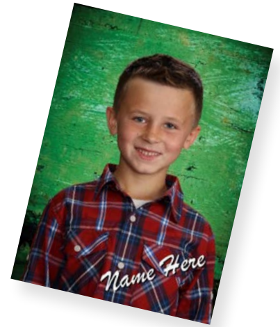
Signature Wallets (8 up) - $1.25

Lab time varies upon product. Visit our website for more product listings.