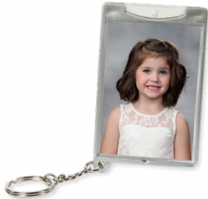
Lighted Keychain - $4.57 Lighted Keychain (2 up) - $6.28