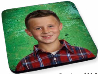
Coaster - $11.93 each Set of 4 - $38.62