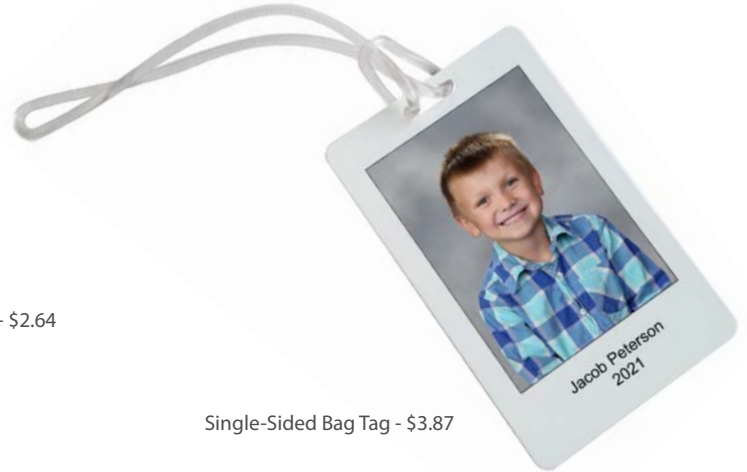
Single-Sided Bag Tag - $3.87