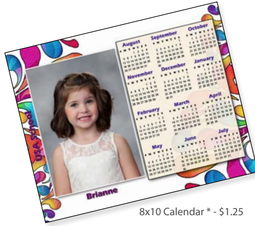
8x10 Calendar * - $1.25