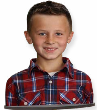
5x7 Black Statuette (1 head) - $19.24 5x7 Clear Statuette (1 head) - $17.88 8x10 Black Statuette (1 head) - $27.69 8x10 Clear Statuette (1 head) - $21.27