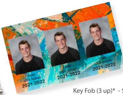
Key Fob (3 up)* - $3.20