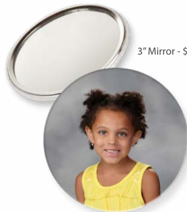
3" Mirror - $2.68