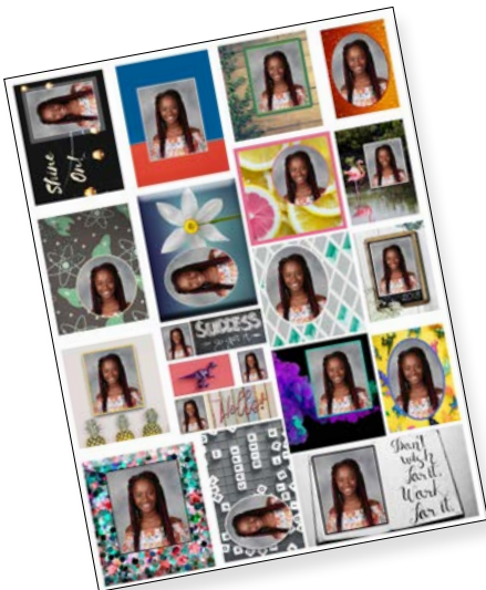
Sticker Sheet* - $2.02 per sheet Includes 19 different stickers