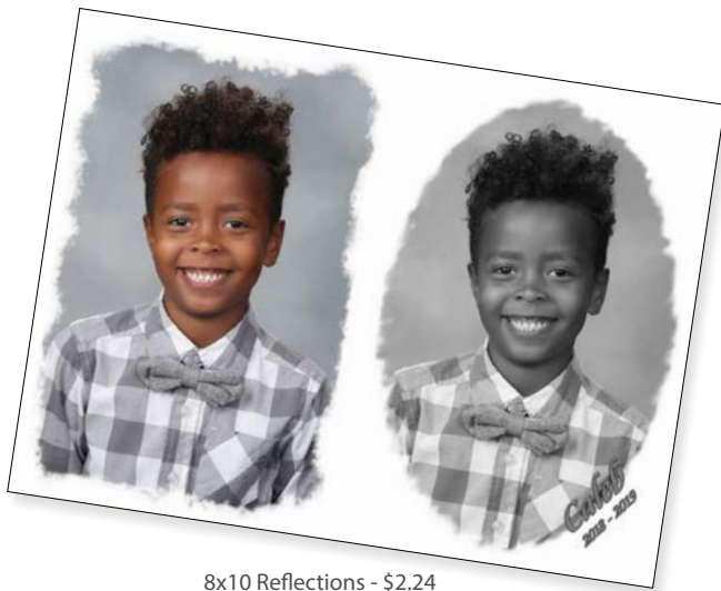
8x10 Reflections - $2.24