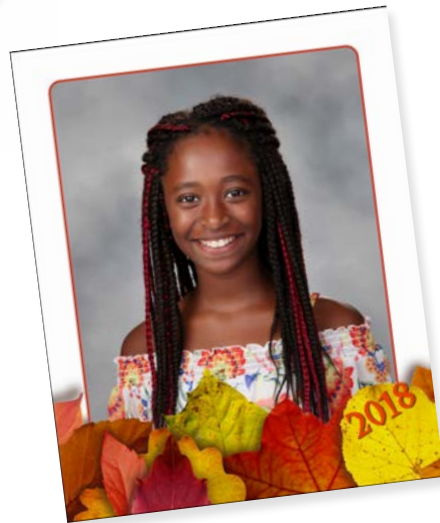
8x10 Keepsake Design - $1.25