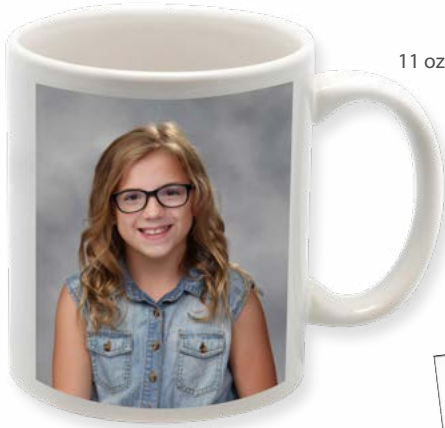
11 oz Coffee Mug - $17.43

5 x10 Dry Erase Board (available upon request) - $11.49 8x10 Dry Erase Board (available upon request) - $12.22