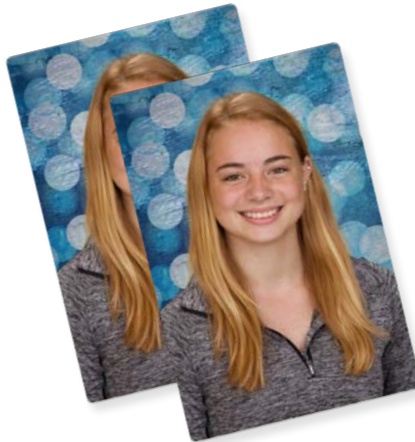
Wallet Sized Magnet - $2.40 Wallet Sized Magnets (2 up) - $4.07 Wallet Sized Magnets (4 up) - $6.15