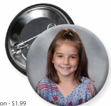
3" Button - $1.99 3" Button (2 up) - $3.34