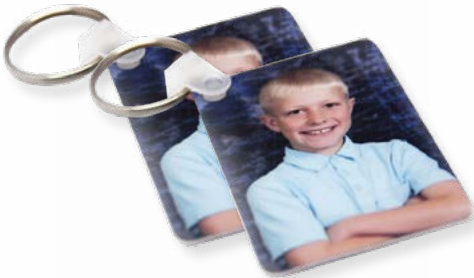
Double-Sided Metal Keychain - $11.08 Double-Sided Metal Keychains (2 up) - $20.33