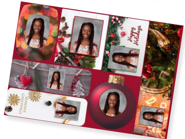
Laminated Fun Pack* - $5.11 each Includes 2 magnets, a ruler, 2 bookmarks, and 2 bag tags