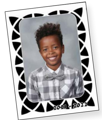
Graphic Wallets (8 up) - $1.25