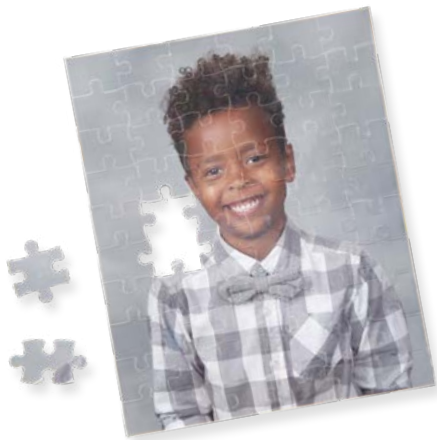
8x10 Puzzle - $10.26