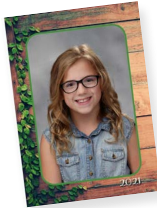
Designer Wallets (8 up) - $1.25