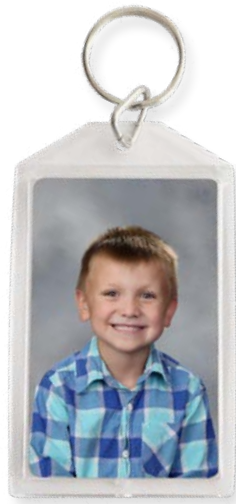
2" Plastic Double-Sided Keychain - $2.64