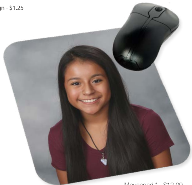
Mousepad * - $12.09

Single-Sided Photo Dog Tag with Chain (no silencer) - $9.69 each* Double-Sided Photo Dog Tag with Chain (no silencer) - $12.88 each